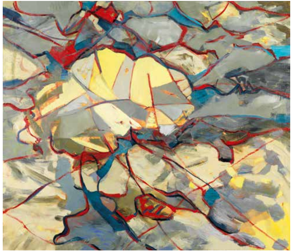
1 Eddy oil on canvas, 130 x 150 cm