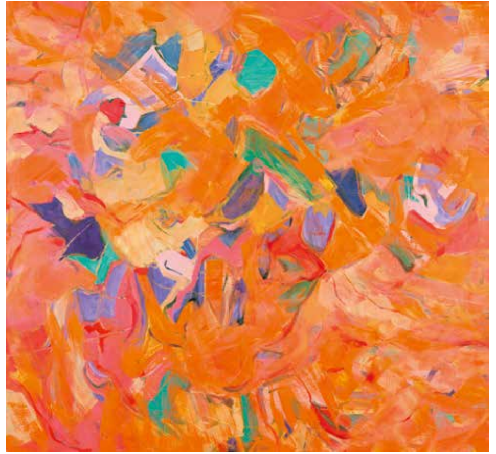
7 Atacama II oil on canvas, 150 x 160 cm