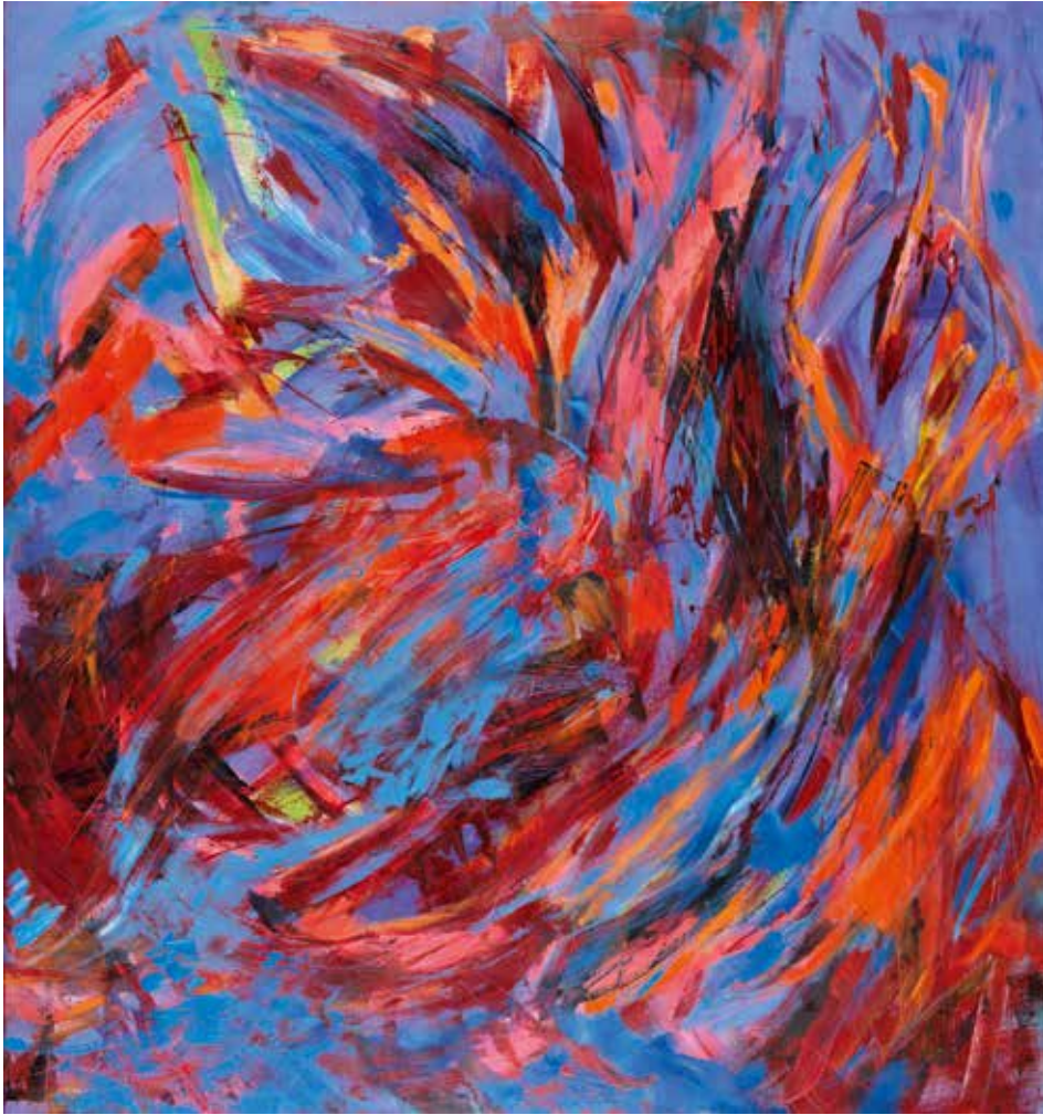
2 Maelstrom I oil on canvas, 160 x 150 cm