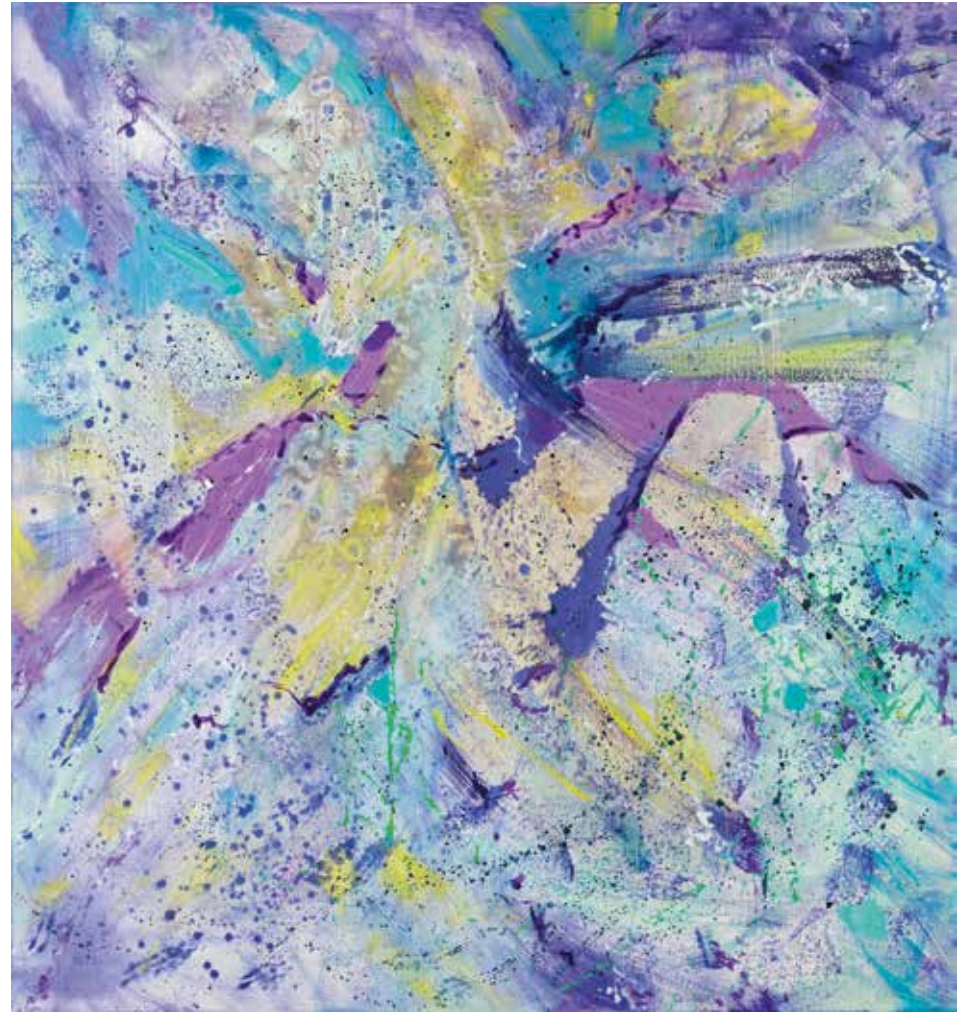
5 Supernova oil on canvas, 160 x 150 cm