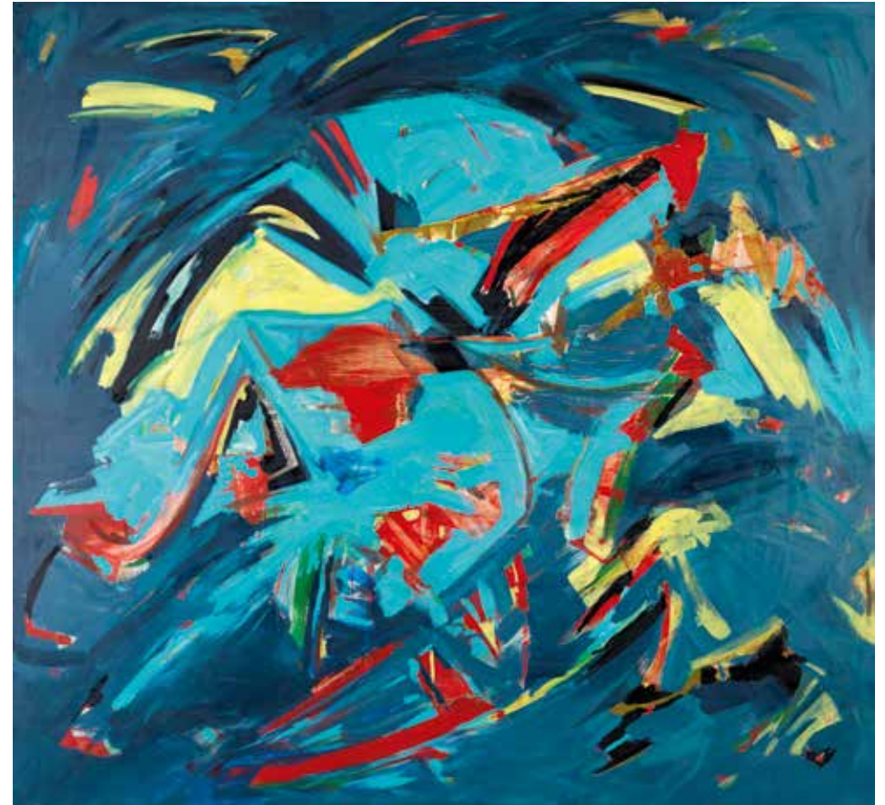
3 Saltstraumen oil on canvas, 150 x 160 cm