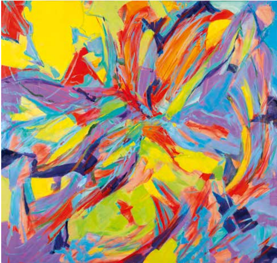
4 Maelstrom II oil on canvas, 150 x 160 cm