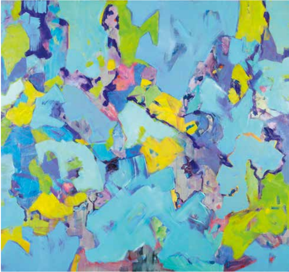
6 Atacama I oil on canvas, 150 x 160 cm